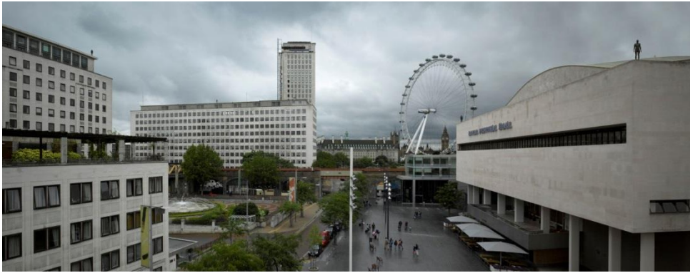
Caption: Event Horizon – Installation view, London, England, 2007 A commission by the Hayward Gallery, London