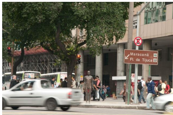
Caption: Event Horizon - Installation view, Rio de Janeiro, Brazil, 2012