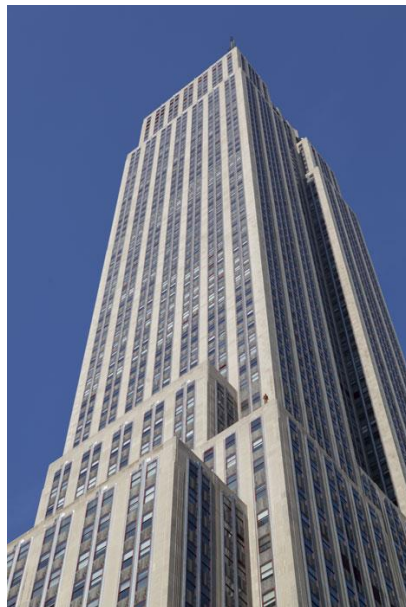
Caption: Event Horizon - Installation view, New York, USA Presented by Madison Square Park Conservancy, New York, 2010