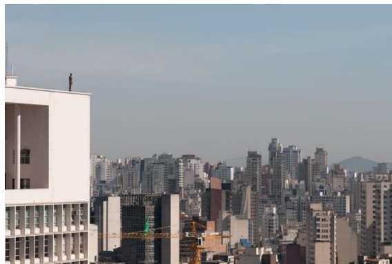
Caption: Event Horizon - Installation view, São Paulo, Brazil, 2012

Please note the below images provided by Event Horizon are not to be edited or cropped. They must be credited exactly as stated.