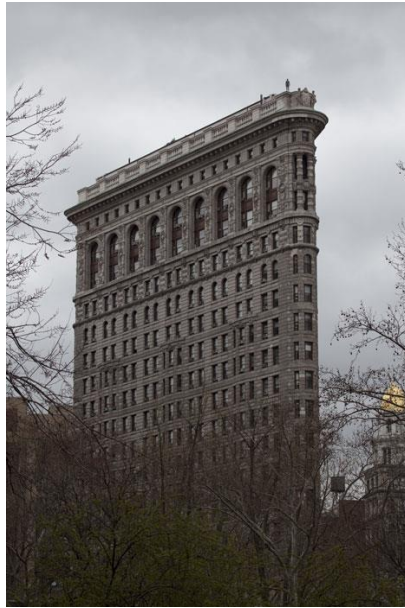
Caption: Event Horizon - Installation view, New York, USA Presented by Madison Square Park Conservancy, New York, 2010